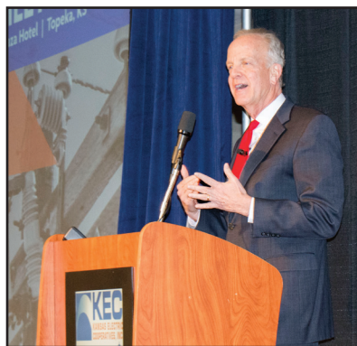
Senator Jerry Moran addresses the attendees at the KEC Annual Meeting.

He stated that Congress needs to reign in regula-